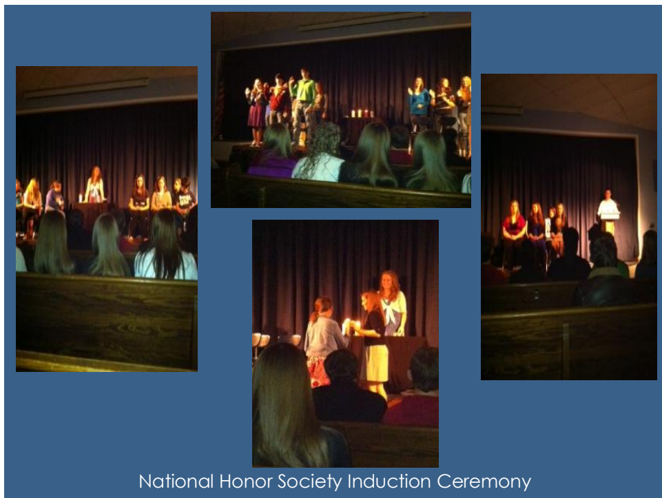
National Honor Society Induction Ceremony